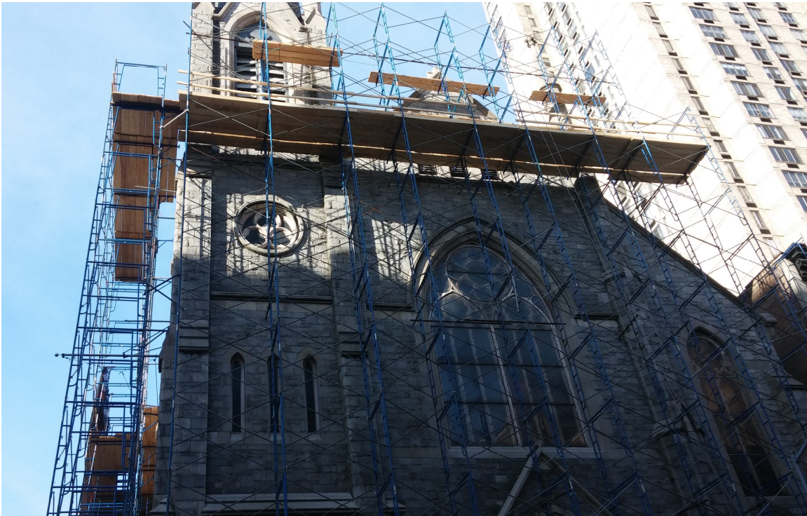
Scaffold at the end of work week two

God bless our scaffold workers! So far, so good. Since this photo was taken, the building of the scaffold has gone on and upward, working its way up our beautiful and high church steeple and all around our church, including our courtyard. The scaffold is now draped in black protective cloth to make sure nothing drops on people below.